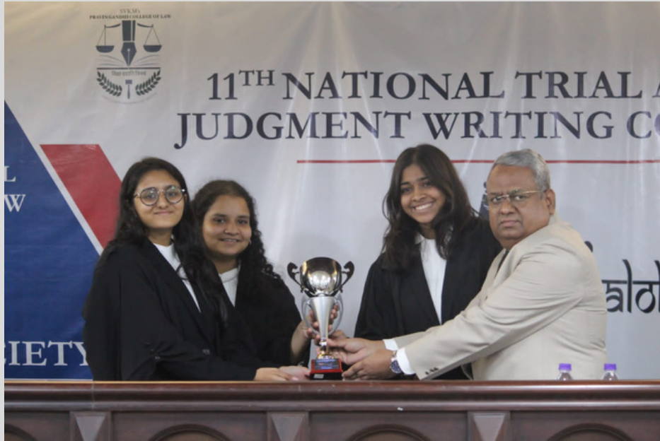
Hon'ble Justice Milind Jadhav, sitting judges of the Bombay High Court awarding the trophy to the Winning team of Nyayavalokan, 2022 – Government Law College, Mumbai