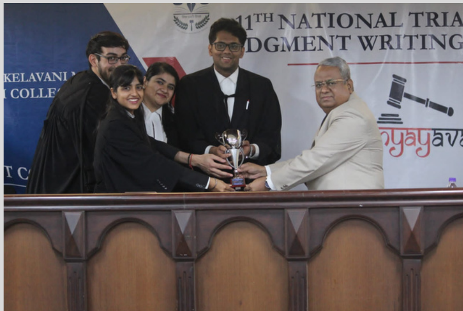
Christ University, Bangalore lifting the Runners Up Trophy of Nyayavalokan, 2022.