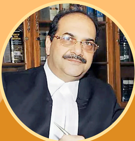
Hon'ble Mr. Justice Abhay Thipsay Former Justice Bombay High Court